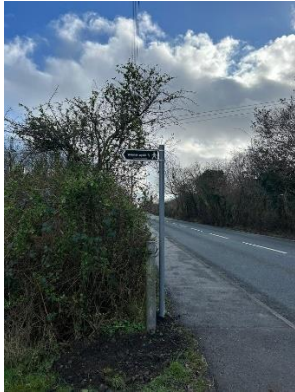
Sign on Garrod Road indicating the footpath to Waunarlwydd