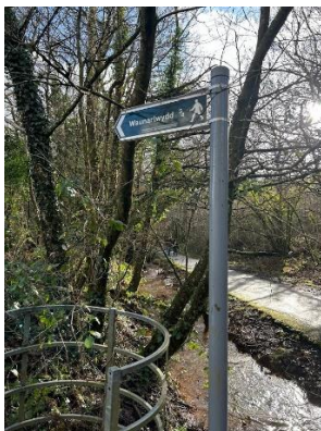
Sign indicating the entry point off the Clyne Valley path of footpath KI103 to Waunarlwydd